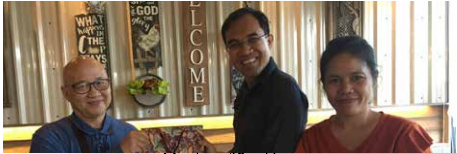
Meeting of Presidents