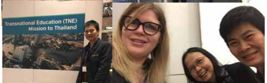
British Council Sponsored Meetings

Transnational Educational Mission Networking Meeting (Brunel