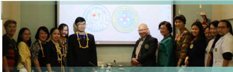
Academic Collaboration Meeting with Dong Nai Medical College October 3-5, 2018 Meeting with the Faculty of Physical Therapy and Faculty of Nursing, Tour of the FPT and FON laboratories, Observation of Classes at Somdej Chaophraya Institute of Psychiatry, Saint Louis Hospital and Simulation Laboratory