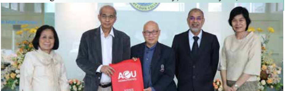
Meeting with Asia e University

Meeting with UK Universities (University of Glasgow, University of Stirling and Robert Gordon University) - February 17, 2019